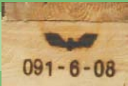
EUR Pallet CD (Czech)