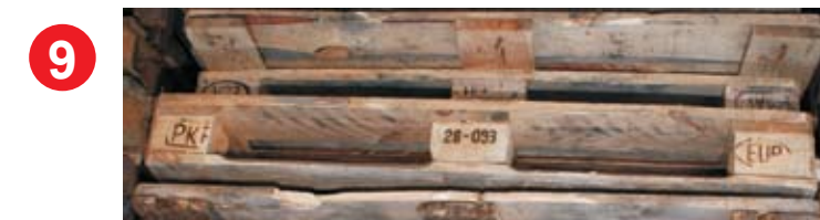
9 Poor general condition of the pallet: - major contamination (e.g. lubricants, grease, cement) - use of impermissible elements – boards, bearers, nails - improper positioning of the elements, e.g. bearer moved versus boards

! Pallets with unacceptable flaws shall be repaired (if possible) or recycled !