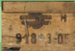
EUR Pallet MAV (Hungary)