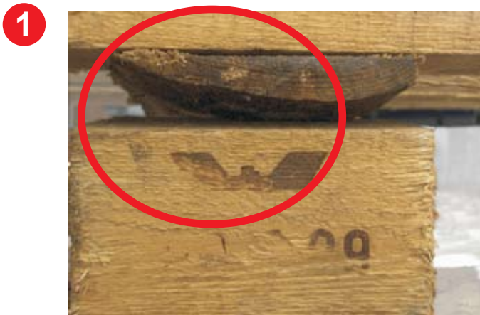
1 Wanes (chippings) are not allowed on the stringer boards (middle, side).