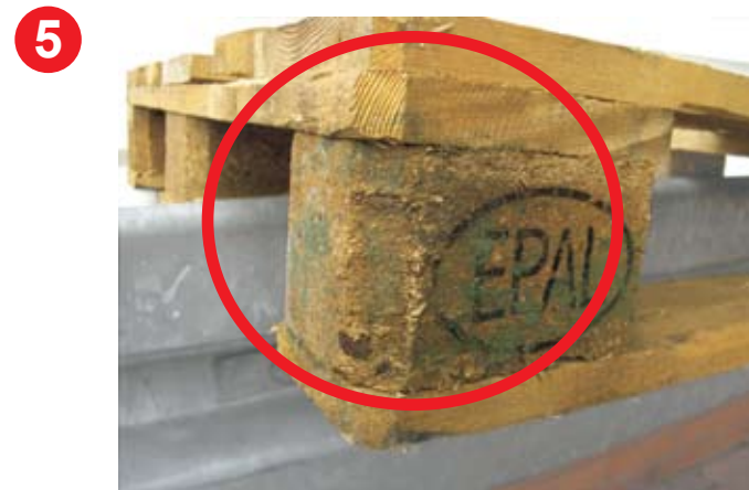
5 No rotten wood or fungus is allowed at all. Such pallets shall be recycled.