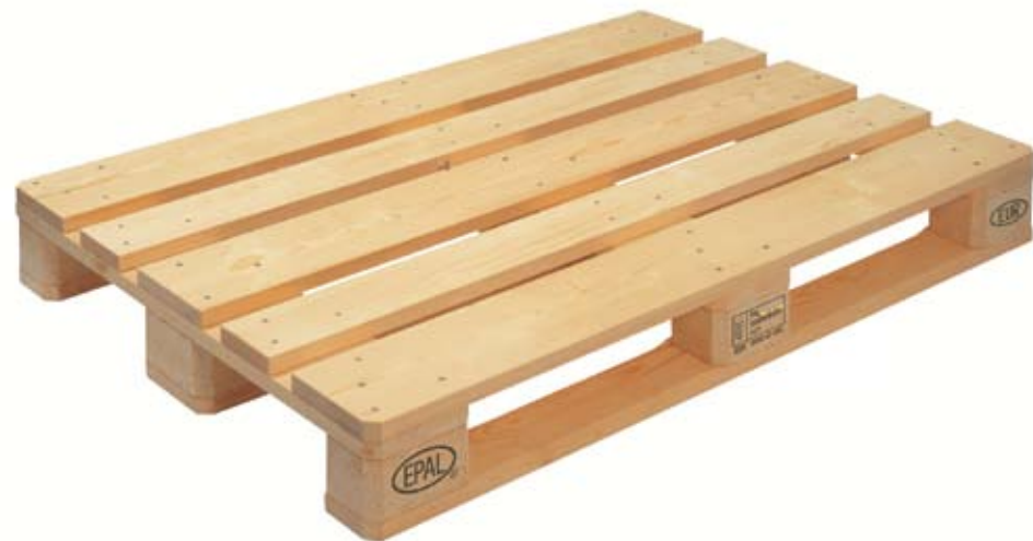
EUR Pallet (800x1200 mm)

The specific EUR pallet types are characterized by various dimensions and construction, but they all comply with rigorous norms and are manufactured accordingly to UIC 435 Code.