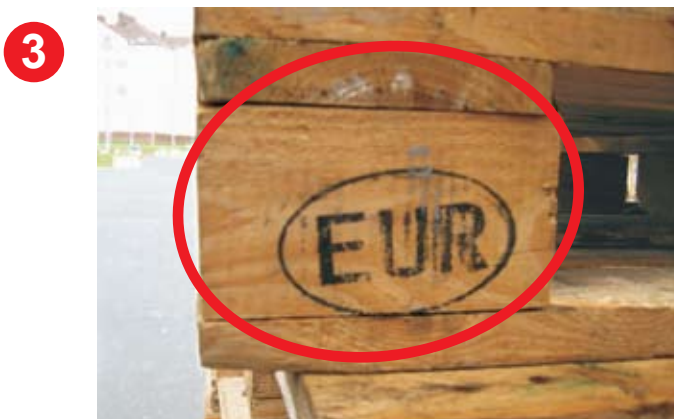
3 Incorrect marking on the blocks.