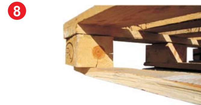
8 It is not permitted to use pallets having their outer boards chipped, provided that the depth of the chipping exceed 2 cm and more than 1 nail is visible.