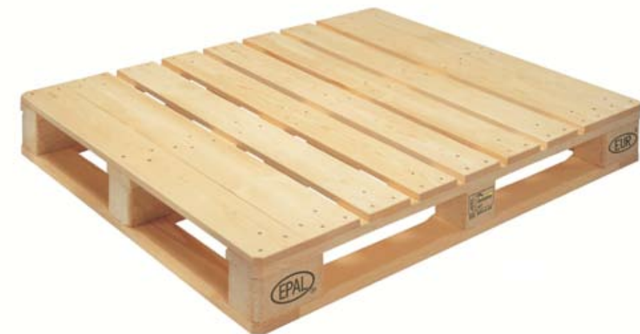
EUR2 Pallet (1200x1000 mm)