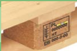
EUR EPAL Pallet