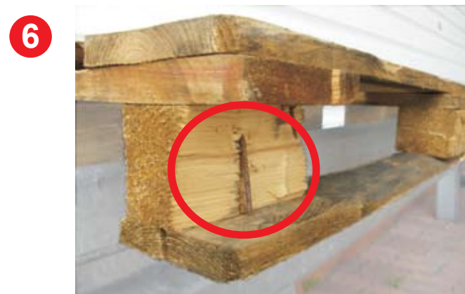
6 Chipped block, exposing any nails.