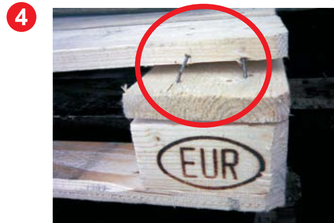
4 Chipped board, exposing 2 or more nails.