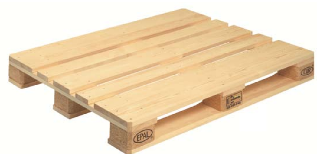
EUR3 Pallet (1000x1200 mm)

The blocks in EUR pallets can be made of either solid or crumbled wood.