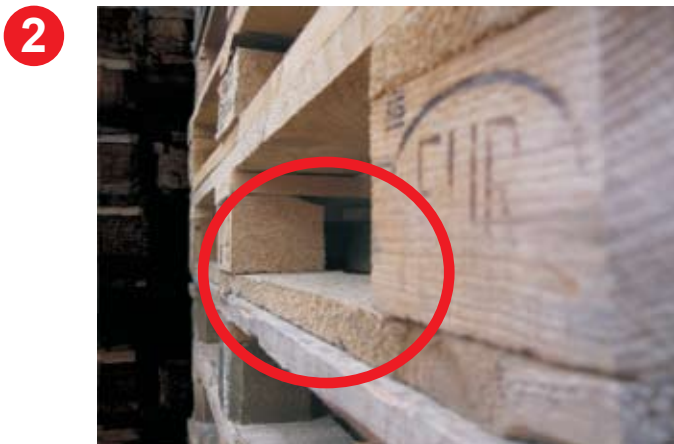
2 No millings on the upper edges of the bottom deck boards.